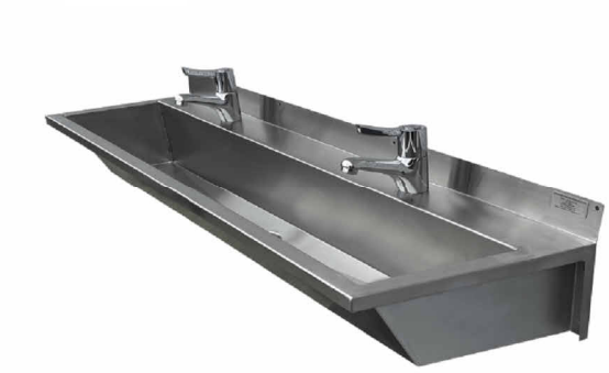
Stainless steel wash trough